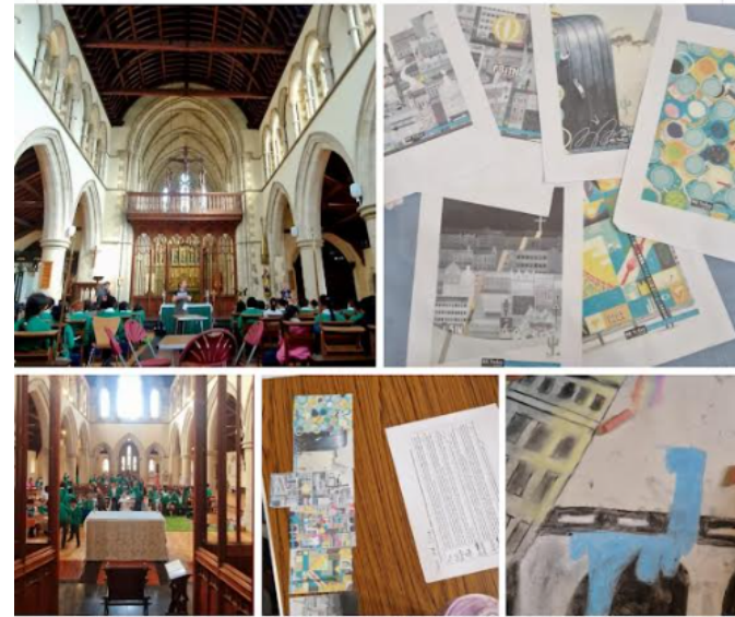
Y6 Art @ St John's Church