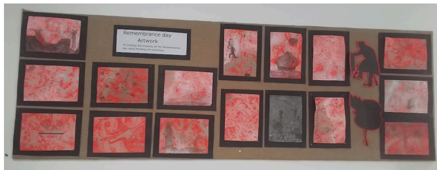
Remembrance Day Art